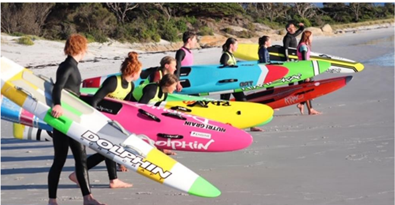
Training at Bicheno