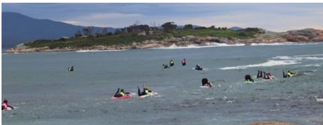
Training at Bicheno